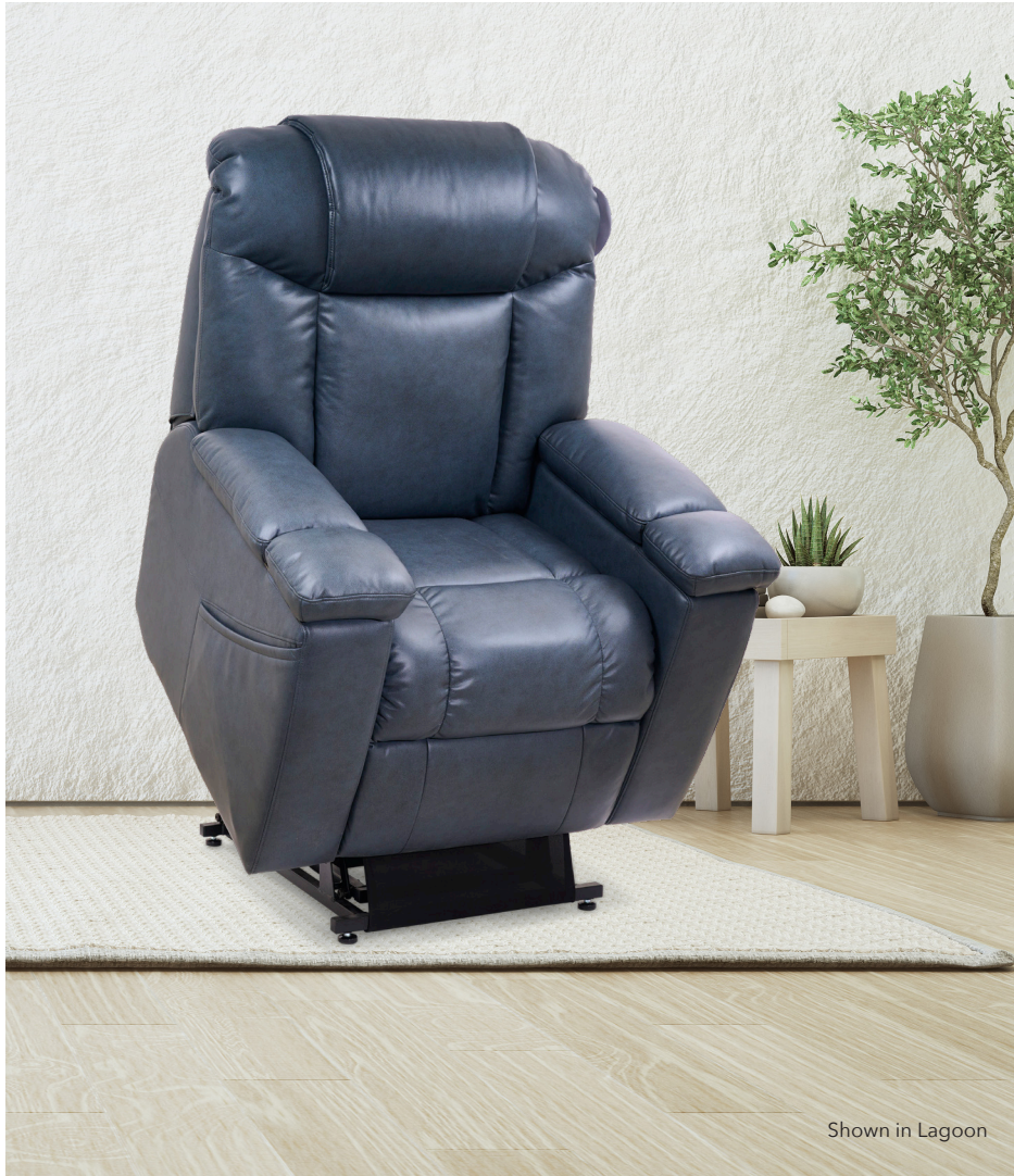
Shown in Lagoon