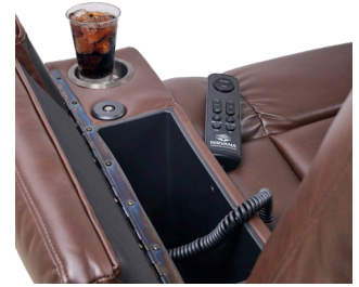
Left Arm: Cup Holder, Power Port & Storage Compartment