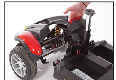
Step 4: Pull forward on the drivetrain release lever to separate the front and rear frame sections!