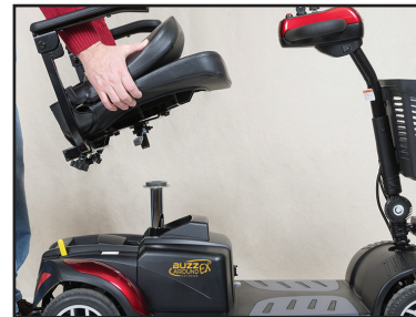
Step 1: Pop off the seat!