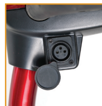
A battery charging port is conveniently located on the tiller under the control panel.