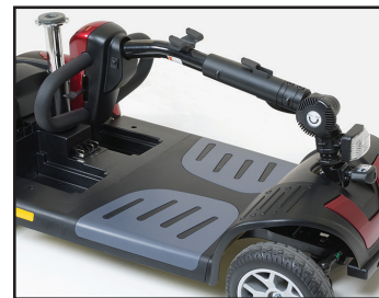
Step 3: Fold down tiller and lock in place!