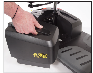
Step 2: Pull out the battery pack!