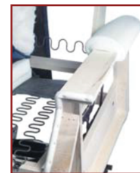
501 M shown

Each luxury lift & recline chair is hand crafted in our facility using decades of motion furniture experience.