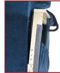
501 M shown

One size doesn't fit all with Golden Technologies seat lift chairs.