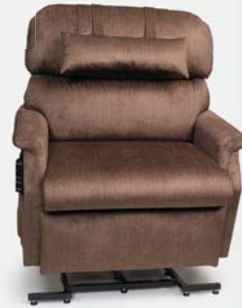
Comforter Super 33 Wide PR-502