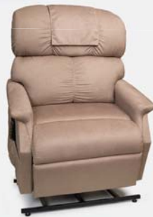
Comforter Medium Wide PR-501M-26D