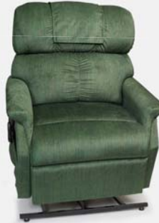
Comforter Large Wide PR-501L-26D