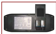
Battery Backup System

*Straight lift option must be set at our factory prior to shipping for these models. Sizes may vary depending on fabric, filling material, upholstery and carpet thickness. All measurements taken on concrete floor using levels and metal rulers.