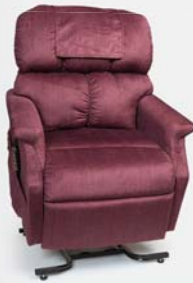
Comforter Small Wide PR-501S-23