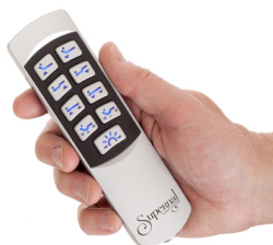
Wireless Hand Control