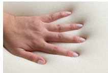
Soft Touch memory foam