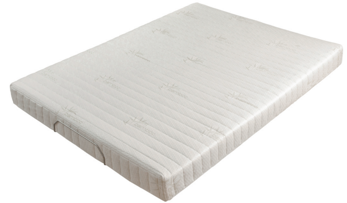
Natural Bamboo Quilted Cover