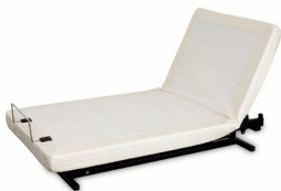
Head Fully Elevated