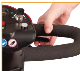
EZ Reach tiller adjustment