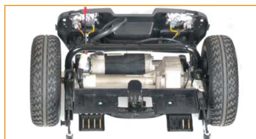
Quiet & maintenance free motor