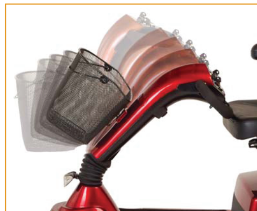
Patented infinite adjustable tiller