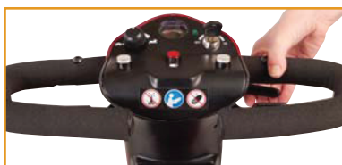
EZ Reach tiller adjustment