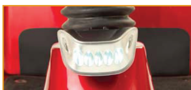
Angle adjustable LED headlight creates a wide path of bright light